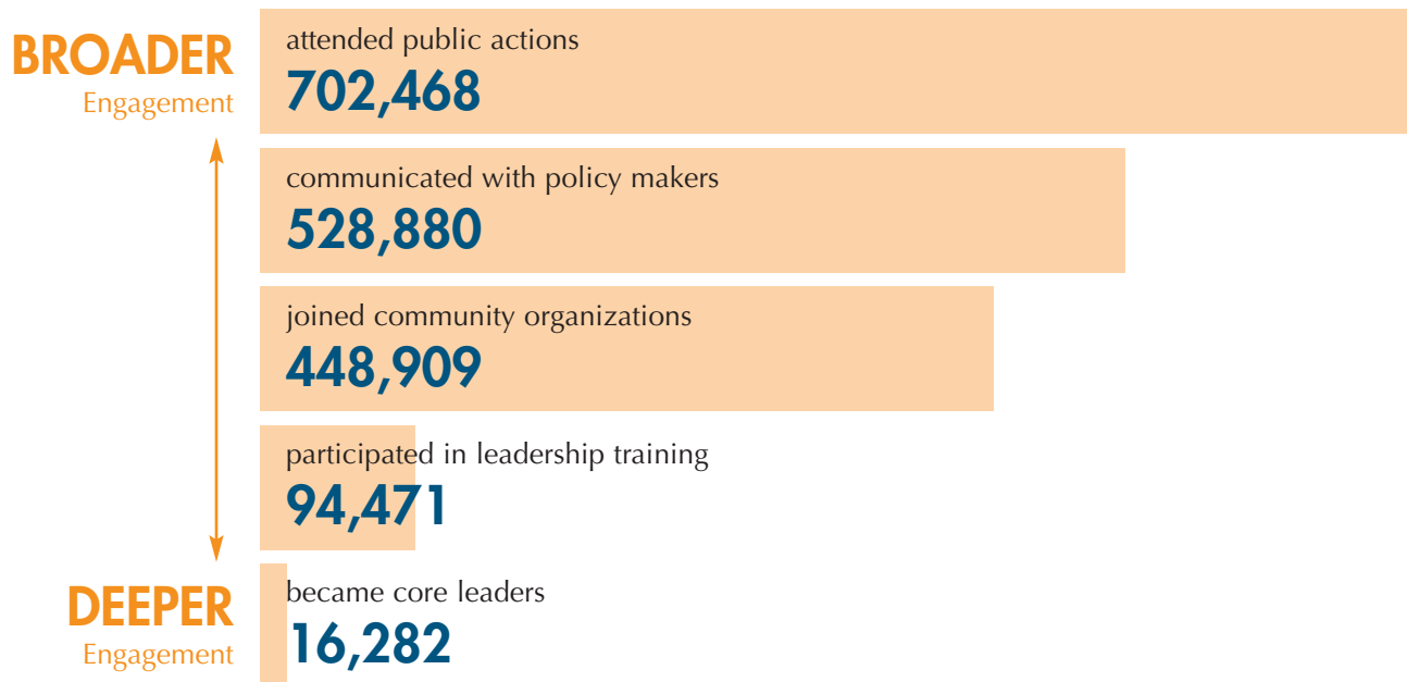
FIGURE 2: SUMMARY OF CIVIC ENGAGEMENT FINDINGS OVER FIVE YEARS

The sample nonprofits viewed civic engagement as both a strategy to achieve policy change and a valued outcome in itself. In our study sites alone, at least 700,000 residents – more than can fit in the seven largest football stadiums at once – were given the opportunity to voice their concerns publicly, and many more were reached through newsletters, radio shows and other means of communication. The 44 nonprofits that reported voter engagement data registered more