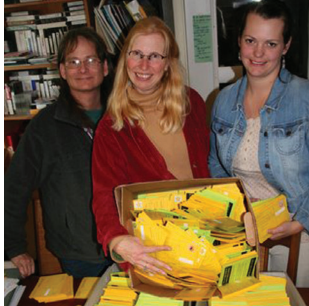
Rural Organizing Project leaders in Columbia County, Oregon, hand address 11,000 postcards to voters to defeat anti-immigrant ballot measures in November 2008.

And state-level litigation can set precedents nationally. The Colonias Development Council and allies filed suit after New Mexico officials ignored community health concerns in approving a permit for what would have been the fourth landfill in rural Chaparral. In a